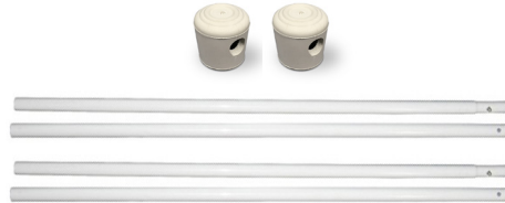
2 piece poles + 2 topper caps