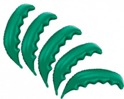
10 palm frond foil balloons (C-BPALM-GR)