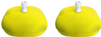
1 set of yellow base covers (C-COVERB-YL)