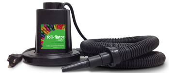
1 FoilFlator electric inflator